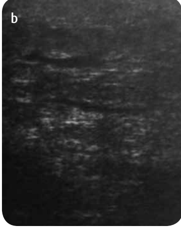
Figure 1. a and b) Ultrasound of soft tissues showing soft tissue edema, no solid or cystic collections or masses are observed.v