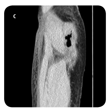
Figure 2. (a) Coronal section, (b) axial section, and (c) sagittal section of CT with contrast medium: In the femoral head plane, subcutaneous emphysema is seen in the soft tissues of the left thigh, generalized and blurred and trabeculation of fat. Thickening of superficial and deep fascia and fluid collections below the fascia.